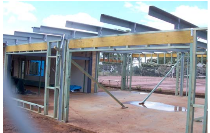
The main room takes shape with the old kitchen and tennis courts in the background

The building work is expected to be complete by the end of January 2011, and community members have volunteered to paint and provide external landscaping and site-works.