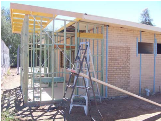
Framework for the upgrade to the toilet facilities takes shape

The Tennis Pavilion was painted and carpeted by the CCAG, and was adequate for committee meetings and meetings of small groups, but could not accommodate functions such as the Christmas Party, the Corop Cup, or Dinner Dances. We have been fortunate in having access to Lake Cooper Estate tasting room, the Victorian Water Ski Association Club Rooms, and Camp Currumbene for larger functions, but this relied on the generosity and co-operation of the respective owners, and while this was always forthcoming, the Group and the town community needed a place which they could call their own.