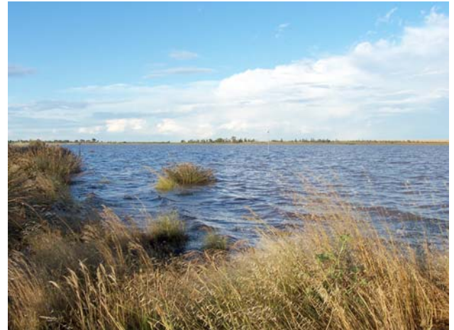
Lake Cooper starts to look like a lake again!