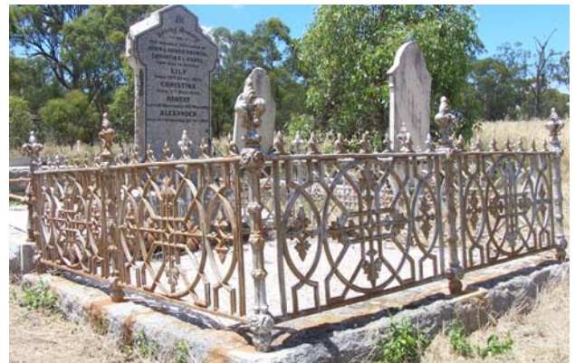
The Thomson family grave has a plot either side of a shared headstone with engraving both sides and ornate wrought iron