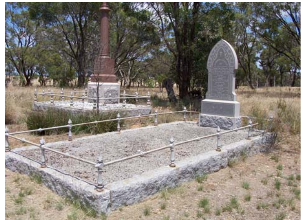
The Phelan family grave from over 100 year ago is 5x2.5metres and has 9 names on the headstone

Recently the Corop Cemetery Trust held their last meeting for 2010. It was decided a twilight meeting at the cemetery would allow the opportunity to do an audit of the state of the headstones.